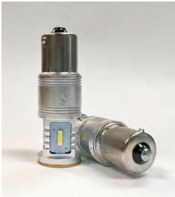
ACTUAL SIZE SHOWN