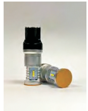
COMMON WEDGE-BASE TYPES