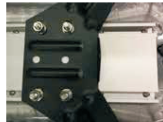
Adjustable Spider Legs

AERODYNAMIC SLEEK PROFILE ADJUSTABLE SPIDER-LEGS FOR FLEXIBLE MOUNTING CONFIGURATION